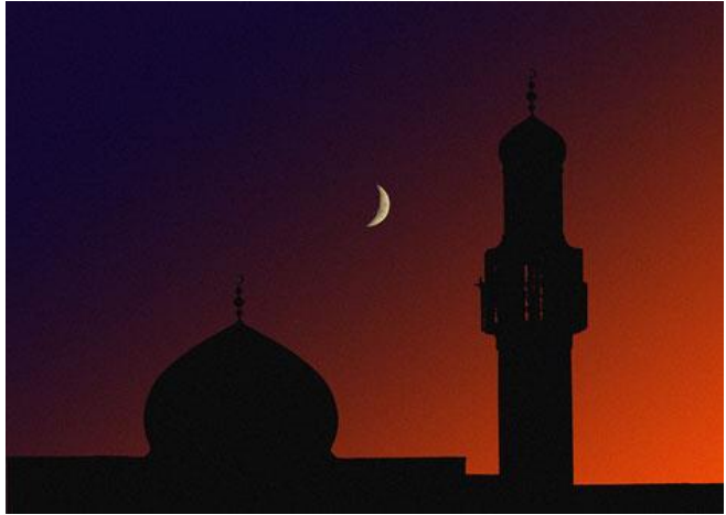
Mosque, Iraq.

http://www.eurozine.com/articles/2015-05-29-whitaker-en.html