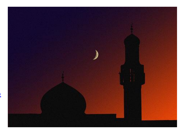
Mosque, Iraq.